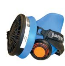
Particle half face respirator.