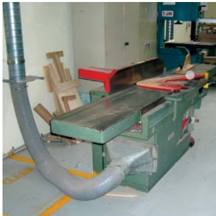
Woodworking dust generated by a buzzer is removed via forced extraction and ventilation.