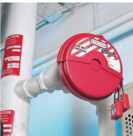
Valve lock and tag.

A tag on its own is not an effective isolation device. A tag acts only as a means of providing information to others at the workplace. A lock should be used as an isolation device, and can be accompanied by a tag.