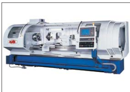
CNC Lathe: Substituting a centre lathe with a CNC lathe (Computer Numeric Control) is an example of improved risk control of machinery and equipment through improvement in design.