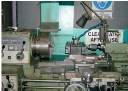
Centre lathe: The exposed rotating chuck of a centre lathe can eject parts or tools with great force, cutting fluid fumes are difficult to contain and the machinery requires manual set-up.