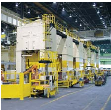
Permanently fixed gantries, ladders and walkways are incorporated into this machinery and equipment to reduce the risk of a fall from height occurring during operation and maintenance.