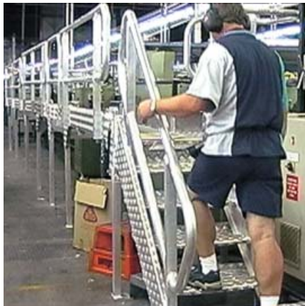
Fixed access platform.