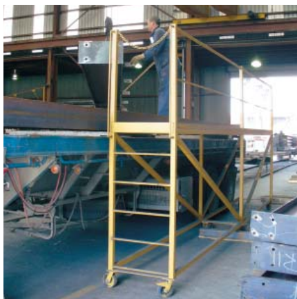
Temporary mobile platform.