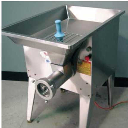
The narrow throat of the mincer prevents a person's hand from accessing the hazard.