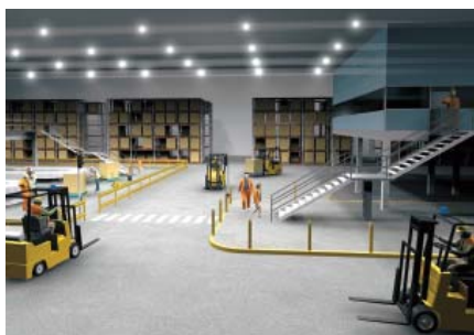
Mobile plant operated in areas where people work may cause injury through collision. Traffic control and segregation are forms of control.