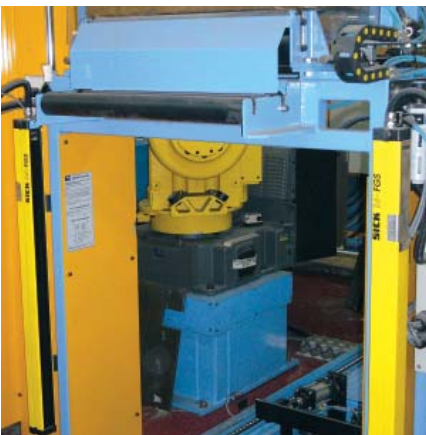
A light curtain used to disable the hazardous mechanism of a machine must resist failure and fault.