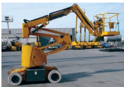
Mobile work platform with fall arrest harness.