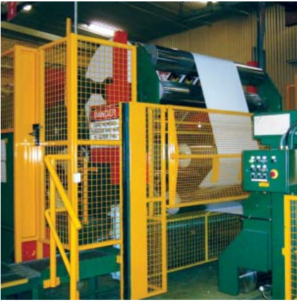
Fences, barriers, guards and interlocked gates separate people from the hazardous action of machinery and equipment.