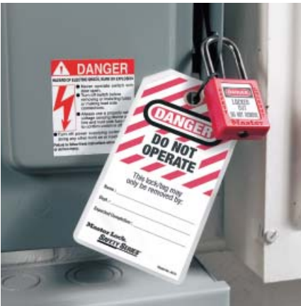
Tag and lock.