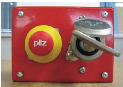
Captive key systems: The key cannot be removed unless it is in the off position. The same key is used to unlock the access gate. Only one key per system is retained by the locking mechanism.

Improved design and technology can be fitted to older machinery and equipment to meet current standards and reflect the latest knowledge regarding ways to control hazards and risks in the workplace.