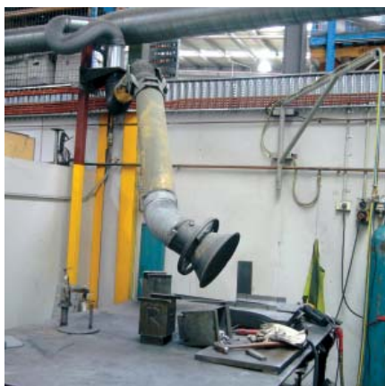
Welding fumes are extracted via flexible, locatable forced extraction and ventilation system.