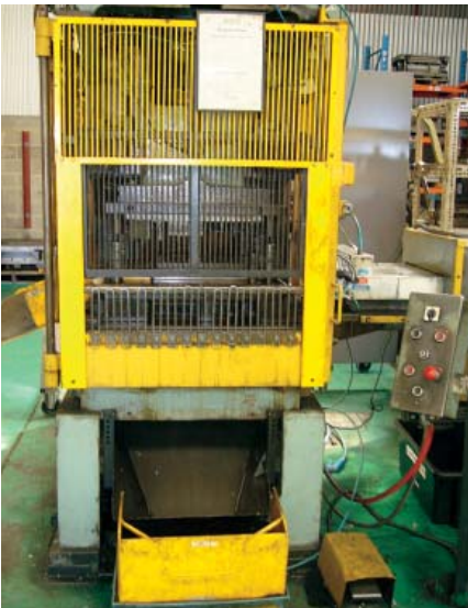
An old style power press incorporating a manual interlock and adjustable guarding. If the guard slides up, a connected metal bar separates the clutch mechanism and the press will not activate.

The guard can be adjusted to provide an opening by releasing retaining bolts on the guard face to allow individual panels to move. Adjustment must be performed by an experienced person to ensure the resulting opening only provides room necessary to incorporate the material being fed in and prevents hands or fingers intruding into the danger area.