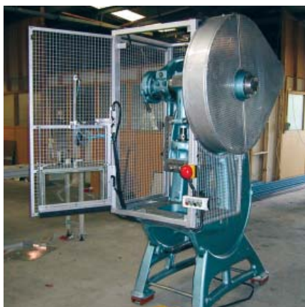
An old style press refurbished with an interlocked safety cage and gate.

The control mechanism uses a combination of pneumatics and electrical interlocking to ensure the danger area of the press cannot be accessed unless the press downstroke action is disabled.